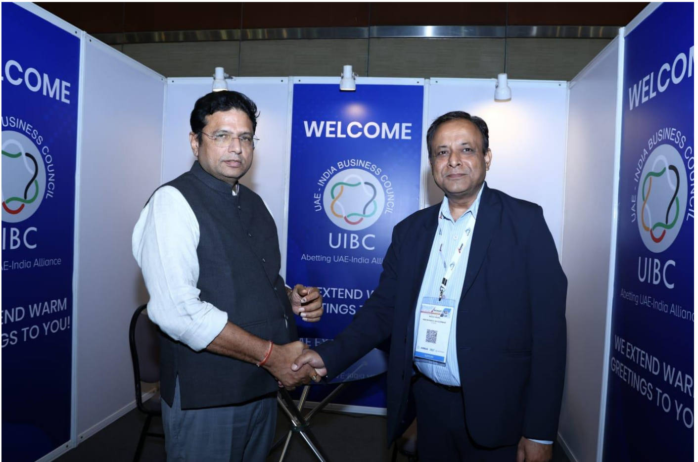
(L to R) - Shri. Duddilla Sridhar Babu, Hon'ble Minister of IT, E&C, Industry & Commerce, and Legislative Affairs, Government of Telangana; Mr Mukesh Kalra, Head - Business Development, UIBC

The first edition of Aeromart was held at Hyderabad International Convention Centre (HICC), Hyderabad, India, from 01 - 03 July 2024. The event was inaugurated by Shri Duddilla Sridhar Babu, Honourable Minister of IT, E&C, Industry & Commerce, and Legislative Affairs, Government of Telangana.